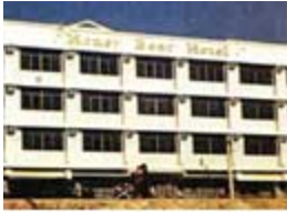
Honey Bear Hotel Kawthaung, Myanmar