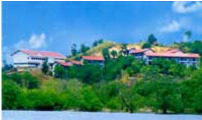
Treasure Island Resort Kawthaung