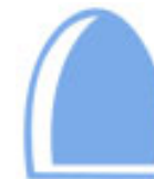
Golden Cave Hotel

Shwe U Min Pagoda Road, Pindaya, Myanmar.