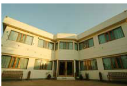
Hotel Amazing Kaytu Taungoo